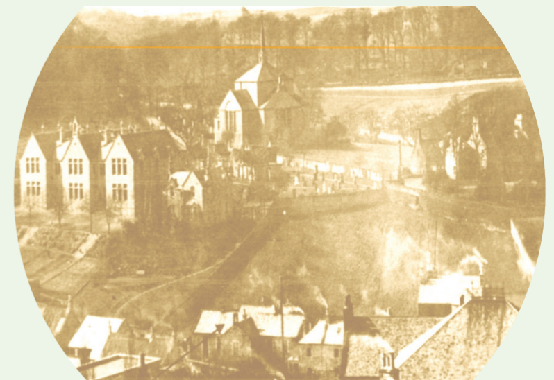
Lasswade village more than 100 years ago. Looking up to the old school.